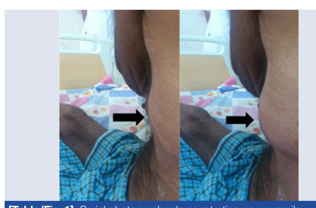
[Table/Fig-1]: Serial photographs demonstrating an expansile swelling with expiratory and inspiratory movements in left infra axillary area(marked with black arrows)

A 53 year old diabetic male, who was on anti – tubercular treatment, presented with an expansile swelling on his chest, at the intercostal drainage (ICD) site. He was diagnosed to have a left sided tubercular hydro – pneumothorax, about six weeks earlier. He had noticed the swelling at the ICD site, 5 days ago and he had no pain. Clinically, an expansile swelling of size 5 x 4 cm, was seen at the 6th ICS, in the mid axillary line, which was partially reducible, with palpable crepitations [Table/Fig-1]. The left hemi – thorax showed reduced movements and breath sounds. Contrast enhanced computer tomographic (CECT) images of thorax showed left upper lobe consolidation, with cavities and a hydro – pneumothorax. The left pleural space was seen to extend through the dehiscence on lateral chest wall, forming an air – filled subcutaneous swell-